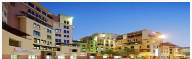
World Laparoscopy Training Institute Dubai