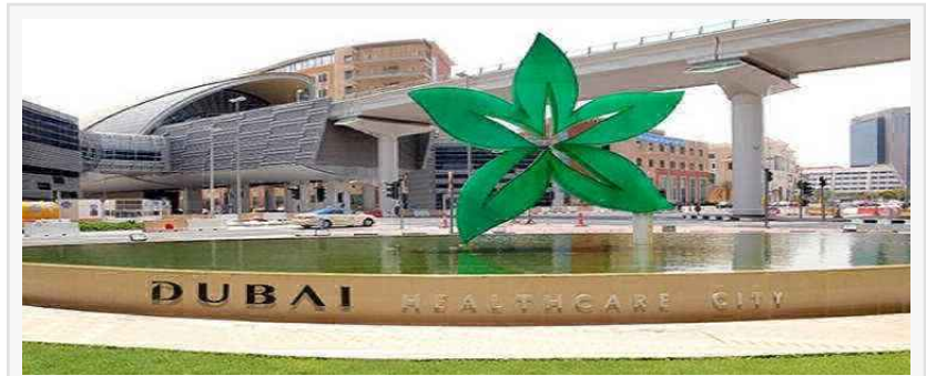
World Laparoscopy Training Institute at UAE

The World Laparoscopy Training Institute at Dubai Healthcare City in Dubai have set up collaboration with the aim of fostering the development of new applications of laparoscopic and robotic surgery. Such collaboration entails the development of a network of internationally renowned minimal access