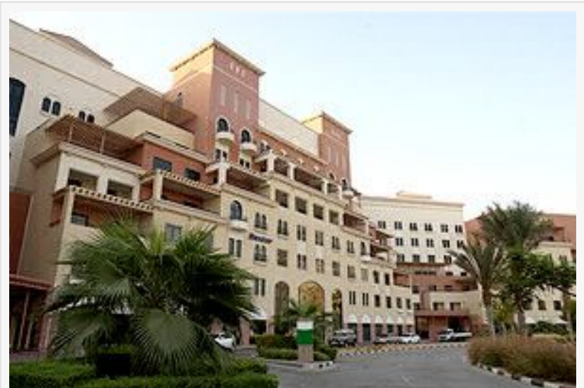
World Laparoscopy Hospital, Dubai

The training offered by World Laparoscopy Hospital, Dubai is a certified and licensed health facility which has been acclaimed for its services in the minimally invasive operations