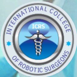
International College of Robotic Surgeons

INTERNATIONAL ACCREDITATION ORGANIZATION (IAO)