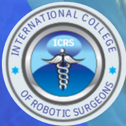
International College of Robotic Surgeons

INTERNATIONAL ACCREDITATION ORGANIZATION (IAO)