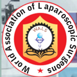
World Association of Laparoscopic Surgeons