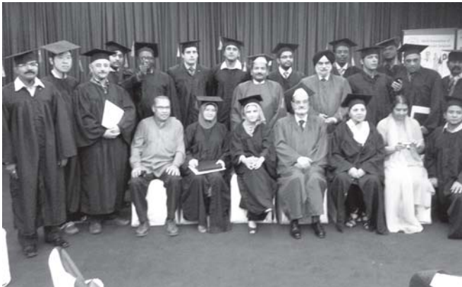
Diploma in Minimal Access Surgery Convocation organized by World Association of Laparoscopic Surgeons