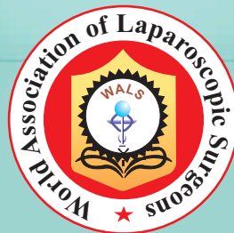
World Association of Laparoscopic Surgeons