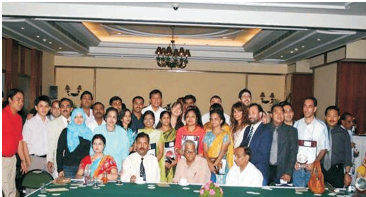
Honourable Mr. George Fernandes, then Defence Minister of India (2001 - 2004) Chief Guest of certificate ceremony

Endoscopic training offered by WORLD LAPAROSCOPY HOSPITAL has an International recognition by World Association of Laparoscopic Surgeons (WALS®).